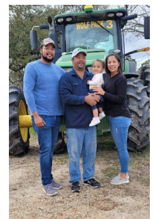
Three generations of the Zenon Family, Louisiana Sugarcane Farmers.